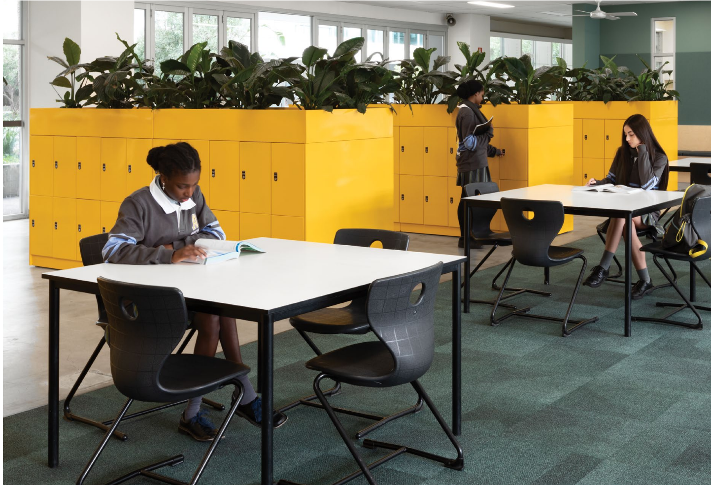
Project: Albert Park College Practice: Jackson Clements Burrows (JCB) Planex liaised with Jackson Clements Burrows and Albert Park College to create functional and flexible spaces. The low-level lockers with custom planters provide safe student storage without obstructing view lines.