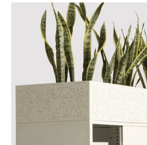
04 Flox planter box