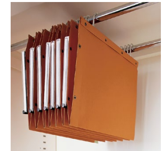
03 Rail assembly