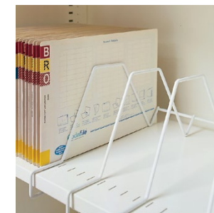
07 Wrap around toast rack