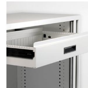
05 Modular drawer and dividers