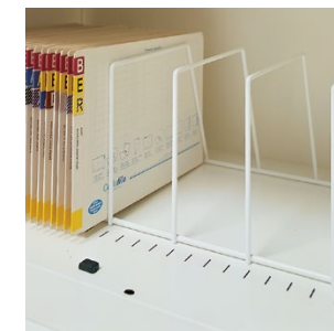
08 Square toast rack