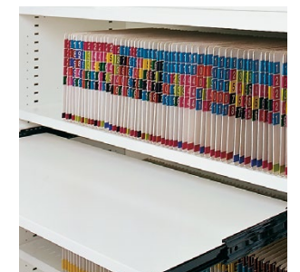
09 Pull-out reference table