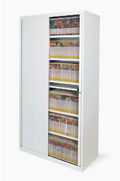
1980H provides six levels of shelf filing or five levels for lever arch folders