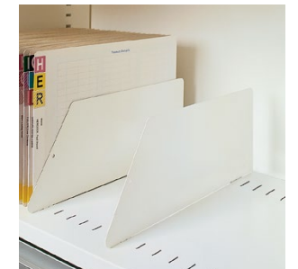
06 Adjustable shelf and dividers