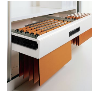
01 Pull-out file frame, north-south